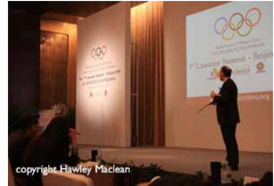
moderating a world summit in Beijing

Critically important for your career and your business.