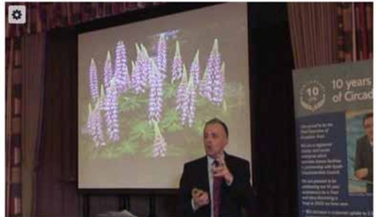
managing your energy and your thoughts during difficult times