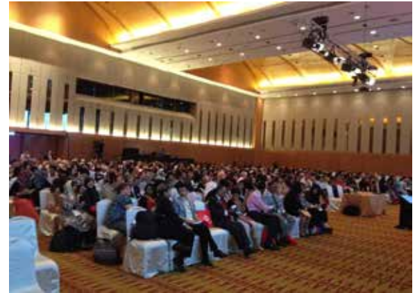
speaker coaching at the annual Toastmasters conference, Kuala Lumpur, Malaysia 2014

(One group of 20 of their surgeons gave Roy a mean average score of 100%!)