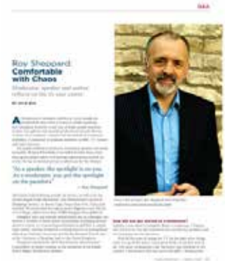
featured in Toastmaster magazine, read by 350,000+ speakers worldwide